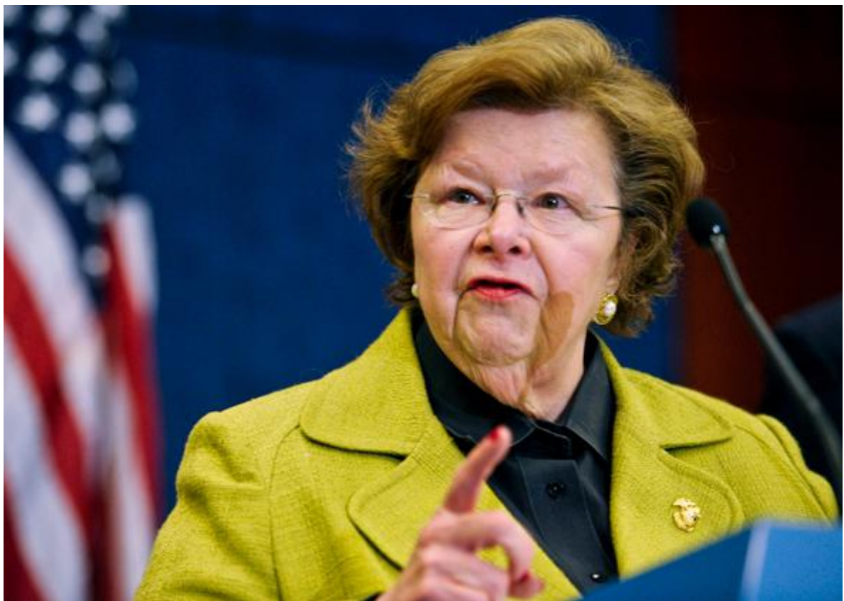
Sen. Barbara Mikulski on June 8, 2011, in Washington.

Mikulski and the rest of the Senate may be surprised to learn that they were repeating 60-year-old justifications of Chinese medicine put forward by Chairman Mao. Unlike Mikulski, however, Mao was under no illusion that Chinese medicine—a key component of naturopathic education—actually worked. In The Private Life of Chairman Mao , Li Zhisui, one of Mao's personal physicians, recounts a conversation they had on the subject. Trained as an M.D. in Western medicine, Li admitted to being baffled by ancient Chinese medical books, especially their theories relating to the five elements. It turns out his employer also found them implausible.