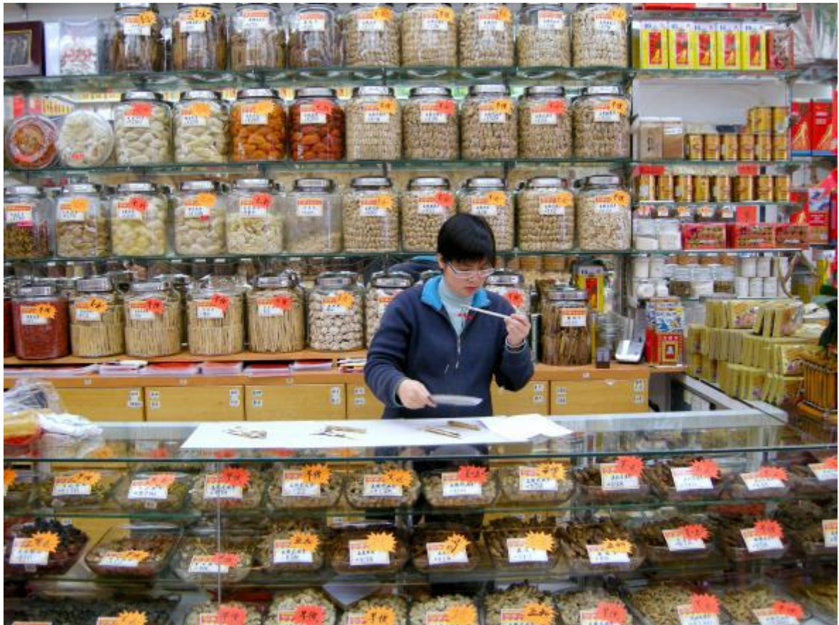
A Chinese pharmacy in Vancouver, Canada.

In 1923, Lu Xun, China's most famous man of letters, reflected critically on his father's visits to a Chinese doctor, visits that bankrupted the family and failed to produce results. "I still remember the doctor's discussion and prescription," Lu wrote , "and if I compare them with my knowledge now, I slowly realize that Chinese doctors are no more than a type of swindler, either intentional or unintentional, and I sympathize with deceived sick people and their families."